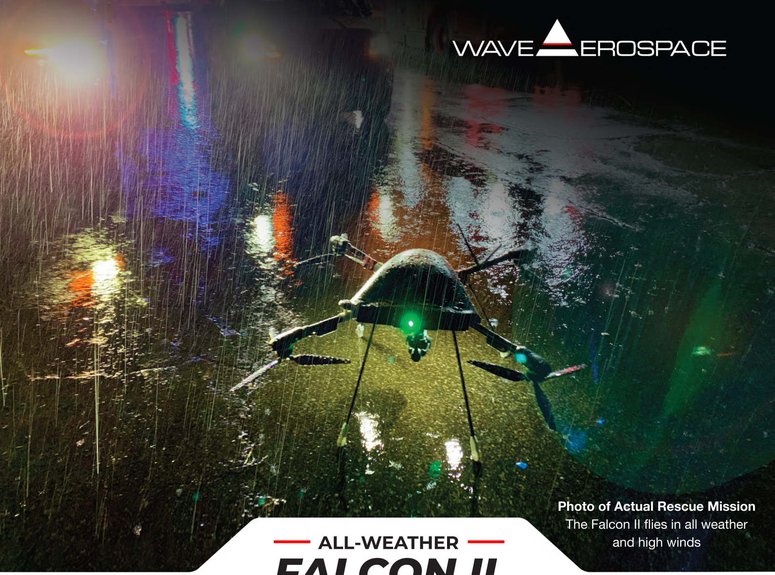
Photo of Actual Rescue Mission The Falcon II flies in all weather and high winds